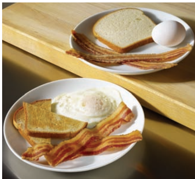
Farmland flavor in a flash! Farmland Parcooked Bacon goes from pan to plate in 90 seconds.

The delicious bacon you've come to expect from Farmland is now available 39% cooked. This saves valuable time in preparation while allowing you to maintain the freshly cooked flavor your customers demand.